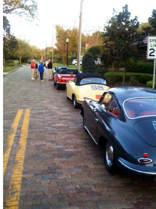
Caravan to Tampa Bay Auto Museum