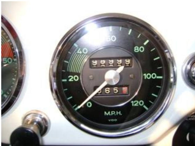
Bismark Rolls Over – Again