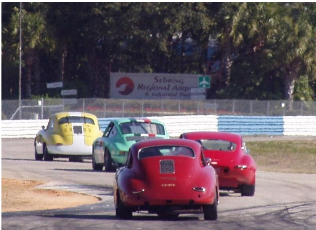
Return with Us Now to Those Thrilling Days of Yesteryear